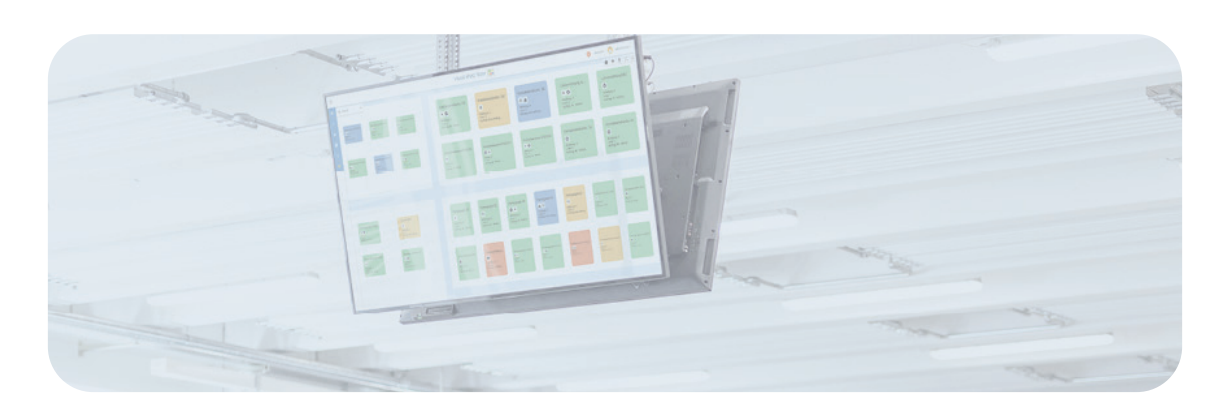
Fig. 3: Intercable Ltd, Visual Shop Floor use in the production hall

and makes them available managers employees real in time based on their roles. With considerable growth, company benefits from stable processes, higher Overall Equipment Efficiency (OEE) and significantly lower error costs.