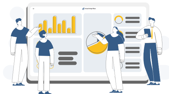
Fig. 3: Illustration Solunio: Shop Floor Meeting with Visual Shop Floor

the central player in this process and is now our basis for optimisation steps."