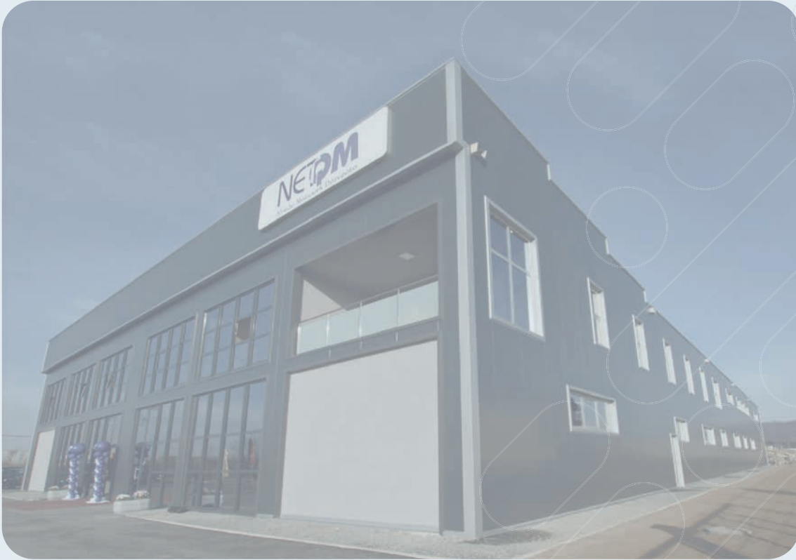
Fig. 1: © NetQM, Production site, Bosnia url: https://www.karriere.at/f/network-quality-management