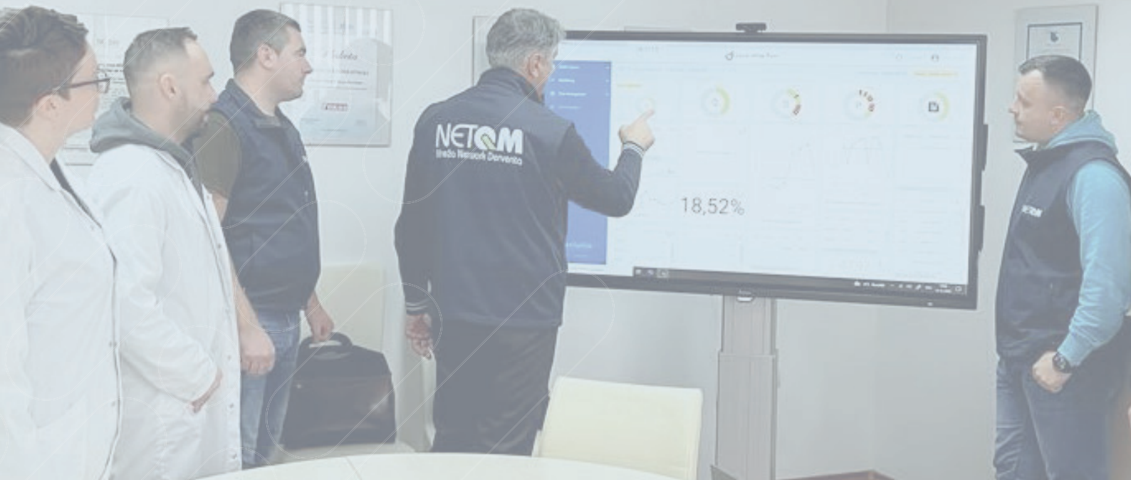
Fig. 4: © NetQM, Visual Shop Floor in practice, Dashboard