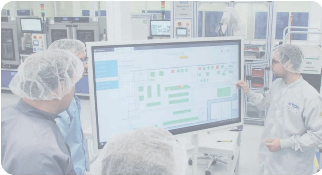
Fig. 2: TDK Electronics AG, Visual Shop Floor in action